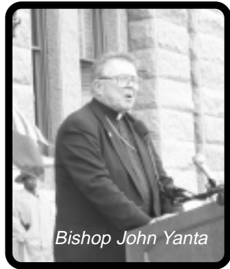
Bishop John Yanta

More than 1,000 people attended the rally.