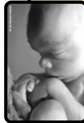
The Prenatal Protection Act means Texas law now recognizes and protects the personhood of unborn children beginning at fertilization, including this 20-week-old baby.

Texas Alliance for Life (with the Liberty Legal Institute) has filed a friend-of-the-court brief with the Fifth Circuit to clarify that Texas Rider 8 policy is indeed constitutional. The court could decide at any time.