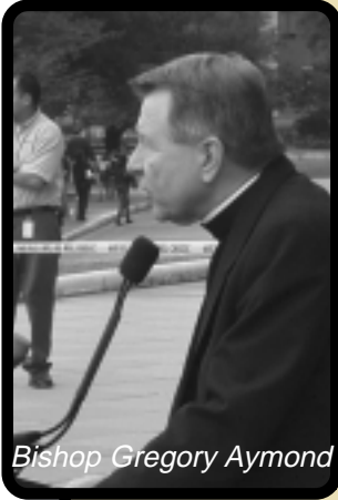
Bishop Gregory Aymond