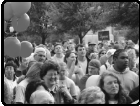
More than 1,000 Texans came from across the state.

On January 24, 2004, TAL held its annual Texas Rally for Life, a peaceful pro-life march and rally, at the state capitol in Austin. The Rally commemorated the 31st anniversary of the tragic Roe v. Wade U.S. Supreme Court decision. The rally also recognized