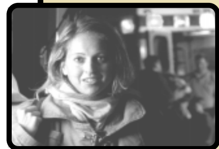
This fire fighter promotes a pro-life message in a new TV ad sponsored by the Majella Society.