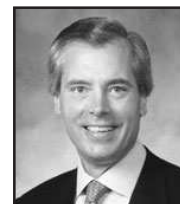
Lt. Gov. David Dewhurst

Please write and thank the leadership who helped to make it happen -- Governor Rick Perry, Lt. Gov. David Dewhurst, and Speaker Tom Craddick.